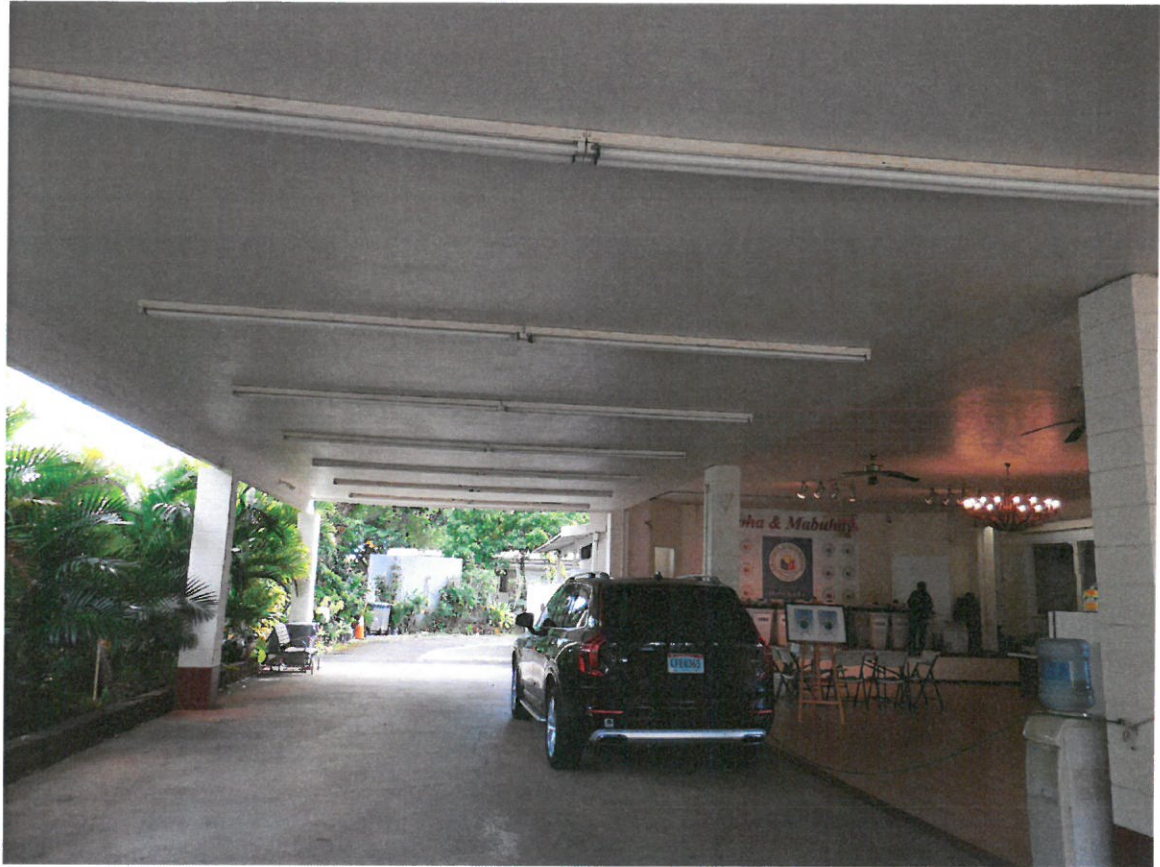
This is another portion of the Lanai, which was extended in 1981 beyond the permitted area (the tiled area to the right of the vehicle). It is encroaching on the property line of the PCG's neighbor, the Hawaii Baptist Academy (the area to the left of the picture).